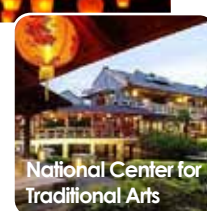
National Center for Traditional Arts