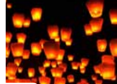
Shifen (Sky Lantern)