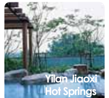
Yilan Jiaoxi Hot Springs