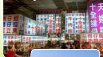
Shilin Night Market